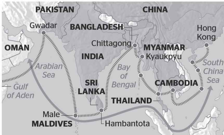
Figure 4 A Possible Configuration of China's Maritime Silk Route