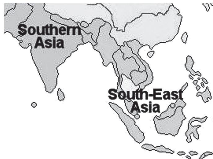
Figure 2 The Conceptual Division of the Bay of Bengal

The strategic fragmentation of the Bay of Bengal was reinforced by a redrawing of mental maps of Asia in the years after World War II. A new region of 'South-East Asia' gained popularity from the late 1940s, and the newly independent states of the Indian subcontinent were grouped into a region called 'South Asia' (see Figure 2). 8 The term 'South-East Asia' first gained prominence in 1943, when the Allies established a 'South-East Asia Command', headquartered in Ceylon, to coordinate the fight against Japanese forces to the east of India. The term was again used in strategic discourse when Washington sponsored the establishment of the SEATO in 1954 as a 'regional' alliance. Although its membership hardly corresponded with current ideas of South-East Asia (including as it did the US, Australia, New Zealand, France, Britain and Pakistan as members), it nevertheless gave further respectability to the idea of South-East Asia as a strategic region. 9