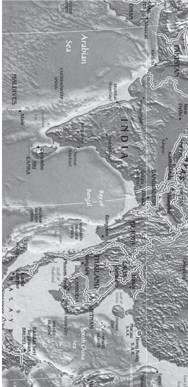
Figure 6 The Three Great Bays of Southern Asia—With the Bay of Bengal at Centre