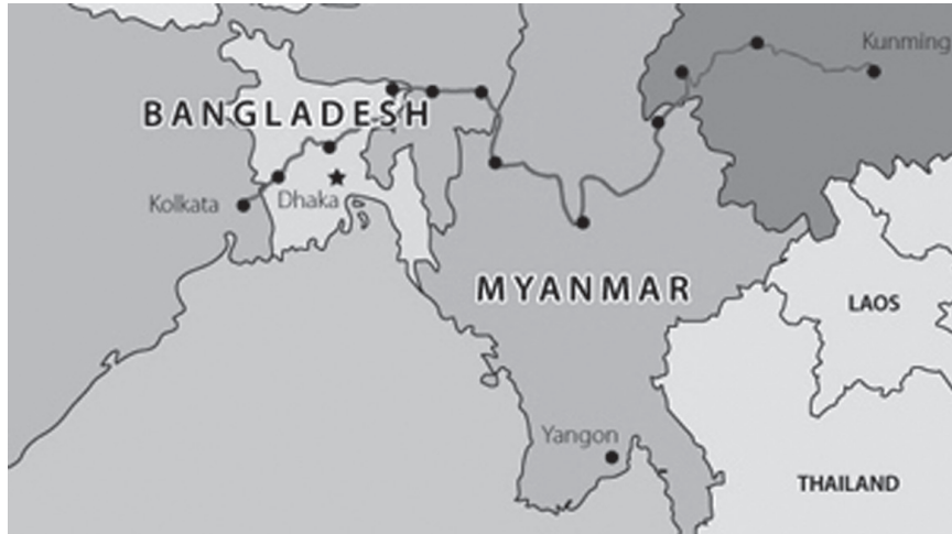
Figure 3 One Proposed Route of the BCIM Economic Corridor Linking China with India