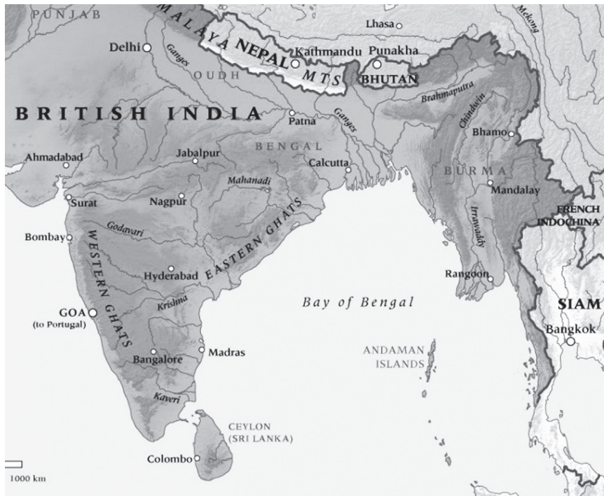
Figure 1 British Colonial Control over the Bay of Bengal