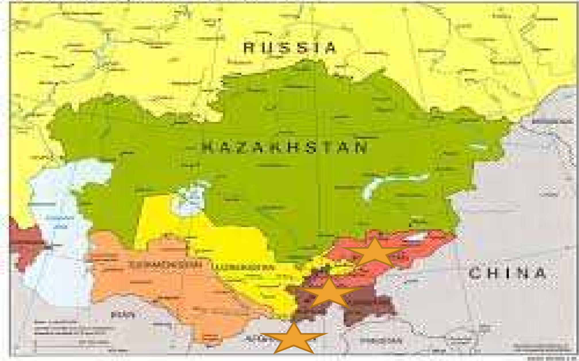
Commonwealth of Independent States - Central Asian States