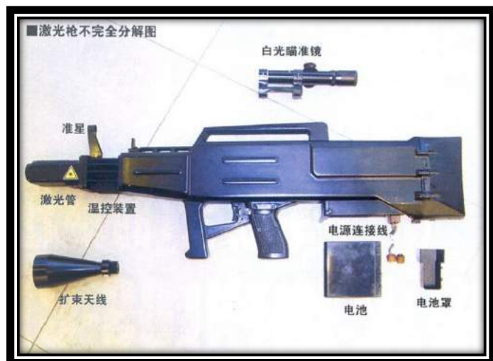
WJG-2002 Laser Gun.

Protocol IV of the Convention on Certain Conventional Weapons prohibits the use of lasers that are specifically designed to cause permanent blindness. Both China and the United States are party to Protocol IV. It does not, however, cover incidental or collateral damage caused while lasers are being used for legitimate military purposes. Under these circumstances, states have no choice but to take protective measures against the use of lasers and begin to use lasers themselves in order to deter others.