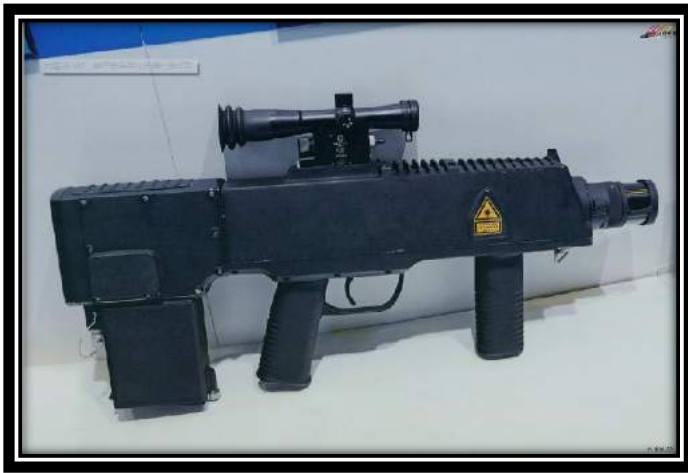
A BBQ-905 Laser Dazzler Weapon.

According to a statement issued by the US Navy, in the third week of February 2020, a PLA Navy destroyer had fired a military-grade laser at one of its P-8 surveillance aircraft flying over the Philippines Sea. The statement noted that the laser beam was not directly seen by US personnel operating the aircraft but was detected by on-board instruments. This is the second time that the United States has highlighted the Chinese military's use of lasers against American aircraft. Earlier, in May 2018, US military officials had claimed that Chinese forces located in China's base in Djibouti have been repeatedly firing military-grade lasers at US military aircraft operating out of America's own nearby base in Djibouti. During one such incident, two pilots aboard a C-130 aircraft even sustained minor eye injury. The United States had