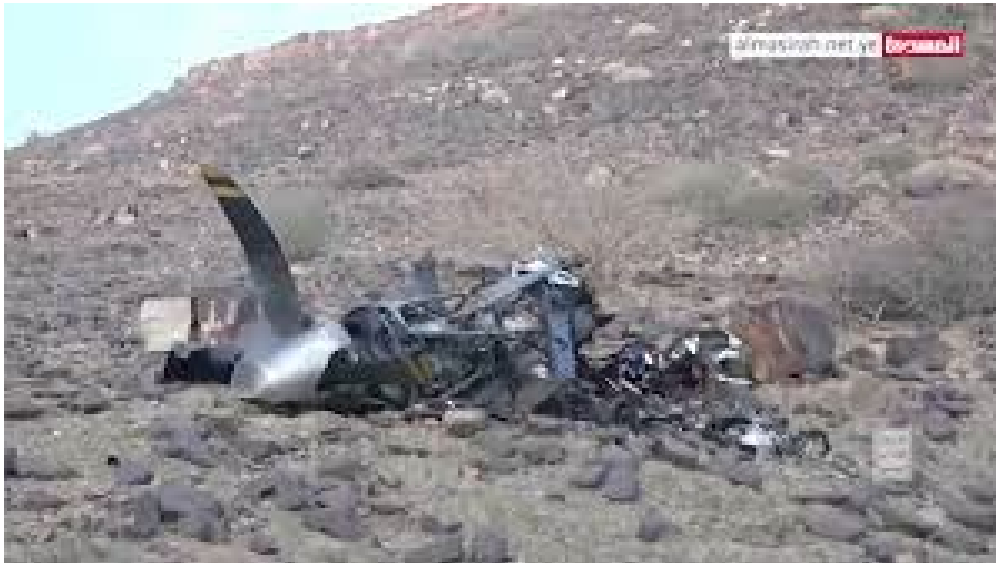
The supposed wreckage of US MQ-9 Reaper drone seen allegedly after the Houthis shot it down over the northern province of Saada, Yemen.

On 28 April 2024, Yemen's Houthi fighters claimed they had shot down another MQ-9 Reaper drone operated by the American military and released some footage to back their claims.