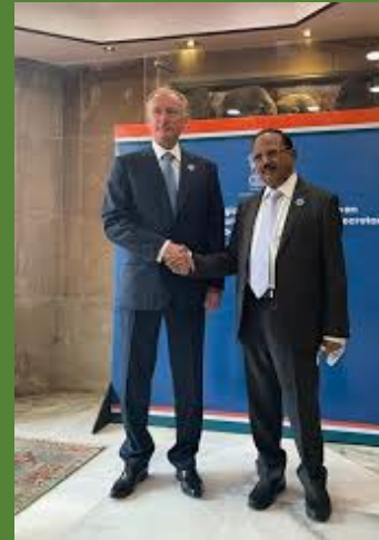
NSA Ajit Doval with his Russian counterpart Nikolai Patrushev

India's National Security Advisor, Ajit Doval, recently met his Russian counterpart Nikolai Patrushev in April 2024 on the side-lines of the XII International Meeting of High Ranking Officials Responsible for Security Matters in Saint Petersburg. Both reviewed India and Russia's progress in bilateral cooperation and shared views on topics of mutual interest. Furthermore, they also placed special emphasis on cooperation between Russia and India on the track of international and regional security. NSA Doval had met his counterpart earlier on the side-lines of the 19th annual meeting of the secretaries of security councils of the SCO, expressing India's solidarity with Russia to address the threat from