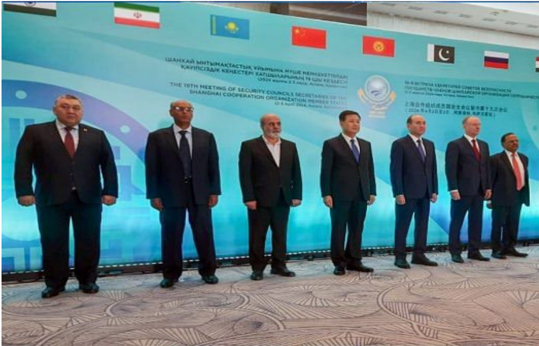
Security Council Secretaries at their 19th SCO Meeting, held in Astana last month.

INDIA CONCERNED OVER USE OF DRONES IN CROSS-BORDER NARCO-TERROR