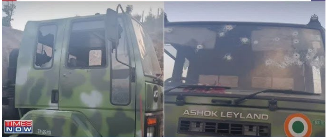
Two pictures of the vehicle that came under attack.