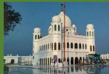
Gurdwara Darbar Sahib, Kartarpur, Pakistan

PAKISTAN-BASED SIKHS RECEIVE THREATS FROM TERROR GROUP