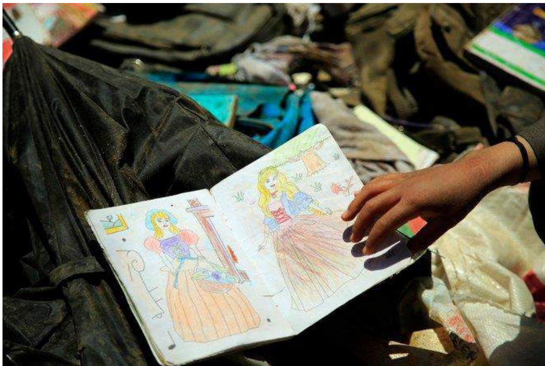
Notebooks of schoolgirls found strewn across a blood-stained road outside the school.

INDIA CONDEMNS RAMADAN ATTACK IN SHIA HAZARA LOCALITY