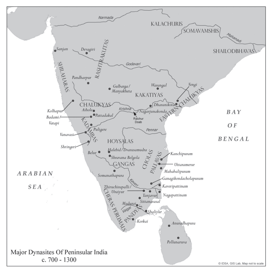
Figure I Major Dynasties of Peninsular India, c. 700-1300 BC

The political history between fifth/sixth and twelfth centuries BCE was dominated by Pallavas, Pandyas, Cheras and Cholas (see Figure 1). K.A.