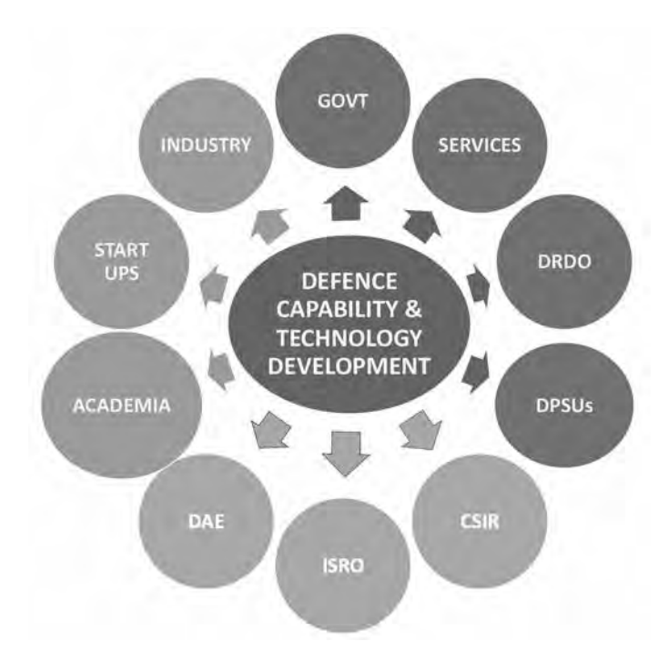
Figure 3 Defence Capability & Technology Development

in stark contrast to their being sought after by multinationals. The services need to carry out a great amount of introspection in this regard. There is also a case for seeding experienced armed forces professionals in the academia to bridge the divide between the two. Special effort must be made to utilise the technological expertise in DAE, ISRO and CSIR labs to contribute to the defence and strategic needs of the nation.