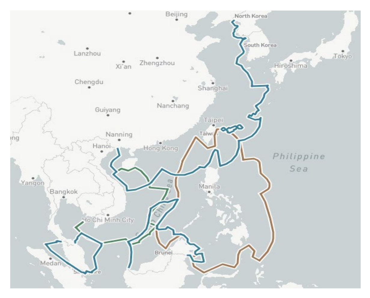
Figure 1. Overlapping Continental Shelf of the Philippines, China, Malaysia and Vietnam in the South China Sea

Further, Article 77 of the UNCLOS grants the coastal State sovereign rights over the natural resources found on or beneath the continental shelf.<sup>11</sup>