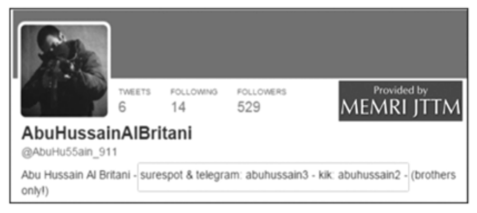
Figure 2: The Twitter profile page of British ISIS operative, Junaid Hussein, sharing contact information for surespot, kik and telegram

ISIS operatives have adopted encryption to secure their online communication, and that makes it an uphill task for law enforcement agencies to track the conversations. Once potential recruits get in touch with the operatives, their communication is moved to encrypted mobile messaging applications available on smartphones such as surespot, kik and telegram (see Figure 2).<sup>15</sup>