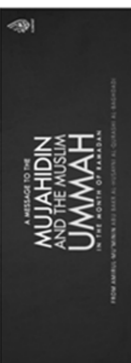
#AlHayat_Media presents: Multi-language translations of the new speech