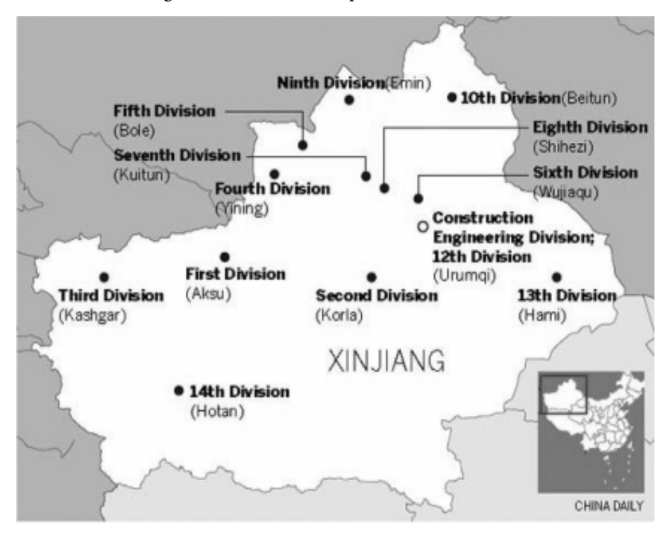
Figure 1: Divisional Headquarters of the XPCC<sup>39</sup>

It is a special social organization, which handles its own administrative and judicial affairs within the reclamation areas under its administration, in accordance with the laws and regulations of the state and the Xinjiang Uighur Autonomous Region and with economic planning directly supervised by the state. It is subordinated to the dual leadership of the central government and the People's Government of the Xinjiang Uighur Autonomous Region.<sup>38</sup>