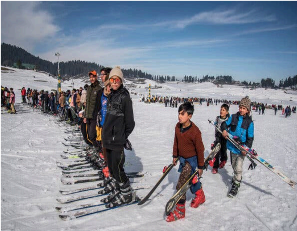
Long line for a ski lift in Gulmarg — File Picture

On the picturesque town of Gulmarg, famed for its breathtaking views, adventure seekers and nature enthusiasts turned out in large numbers after a recent snowfall ended over a two month dry spell.