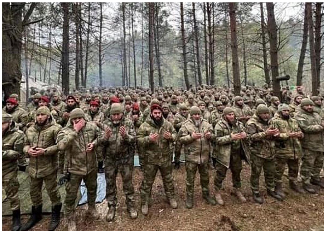
Chechen jihadists fighting for Russia can be seen praying inside Ukraine.

PUTIN'S ALLY KADYROV MARSHALS CHECHEN JIHADISTS AGAINST UKRAINE