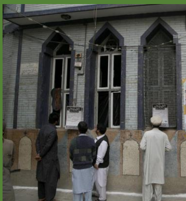
Local residents gather outside the Kucha Risaldar mosque, the site of the suicide bombing claimed by ISIS.

Amaq, the Islamic State's propaganda website, claimed responsibility for the deadly bomb blast, killing a large Shia congregation. The statement declared that "Today Friday, an Islamic State fighter succeeded in assaulting a Shiite mosque in Peshawar."