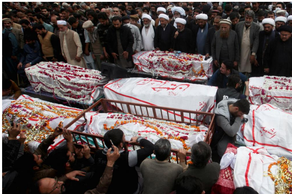
Bereaved friends and relatives at the funeral prayers of the slain worshippers.

SUICIDE BOMBER TARGETS FRIDAY CONGREGATION: OVER 200 INJURED