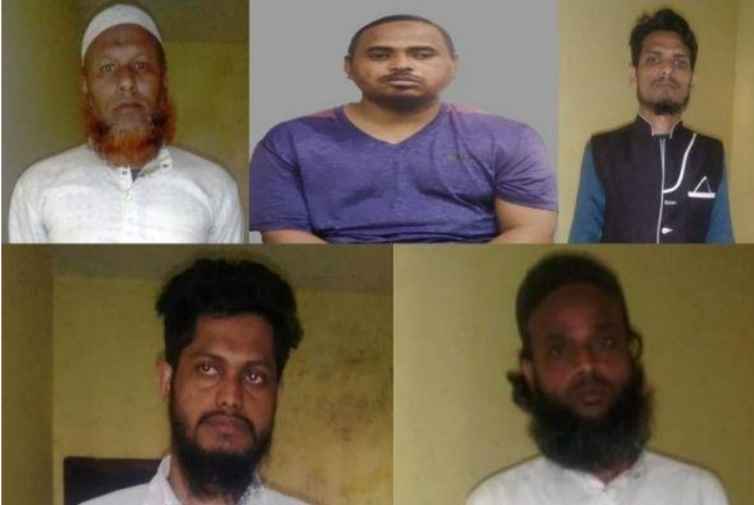
Arrested Bangladeshi nationals captured by the Assam Police

PROBE INTO BANGLADESHI SUSPECTS MAY COVER SEVERAL STATES