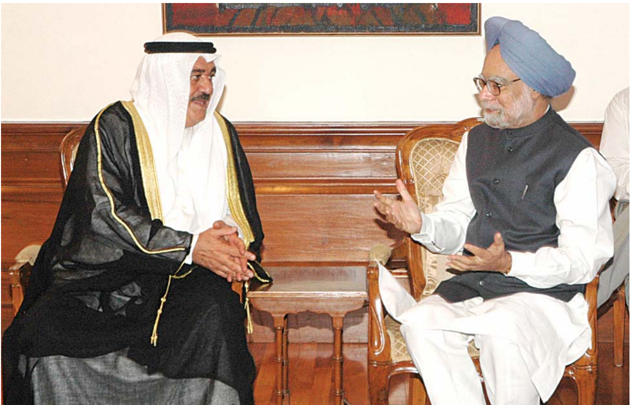
Minister of Finance, Kuwait, Mustafa Jassim Al-Shamali calling on the Prime Minister, Dr. Manmohan Singh, in New Delhi on 3 July, 2008.