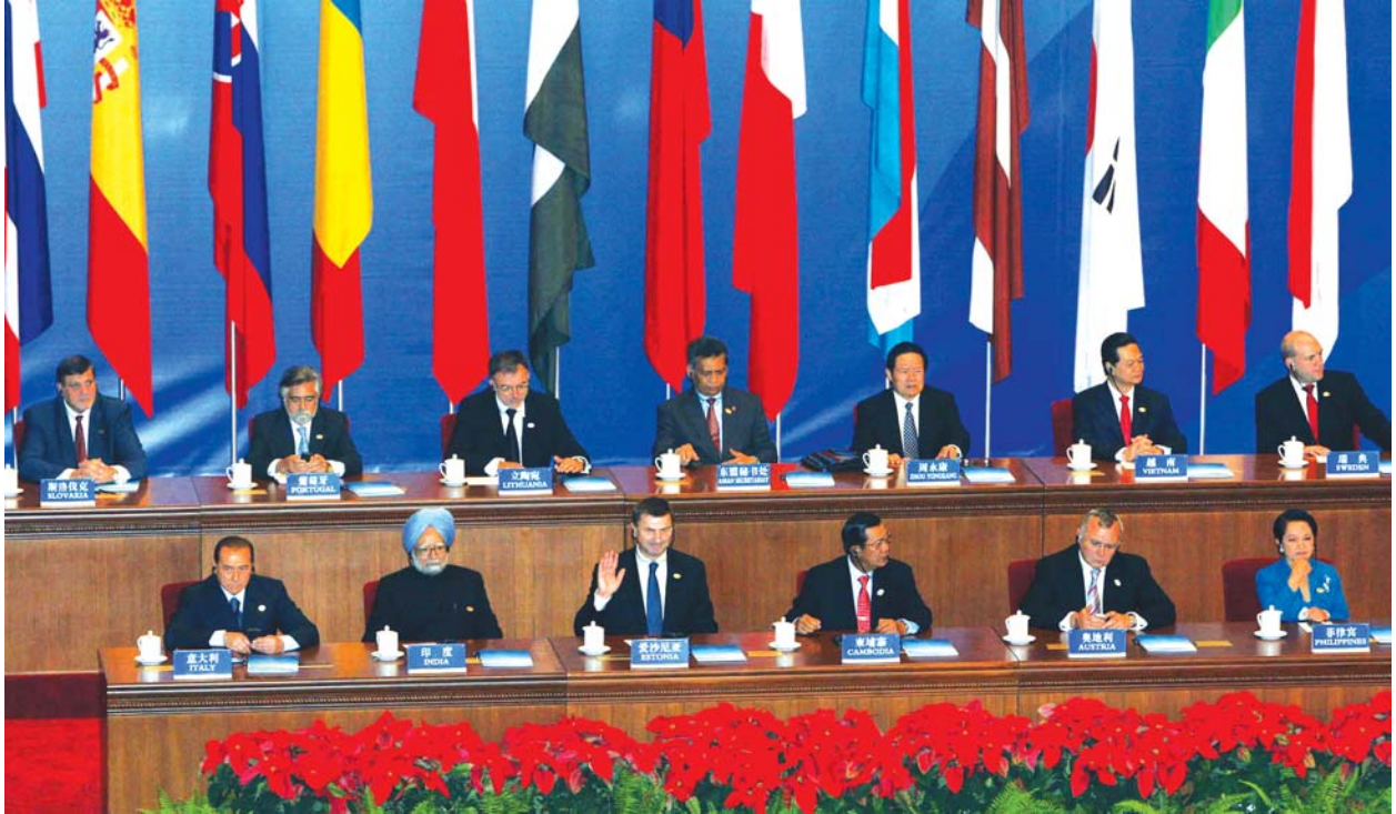
Prime Minister, Dr. Manmohan Singh and the other Heads of State at the opening ceremony of the Seventh ASEM Summit at the Great Hall of the People, in Beijing, China on 24 October, 2008.