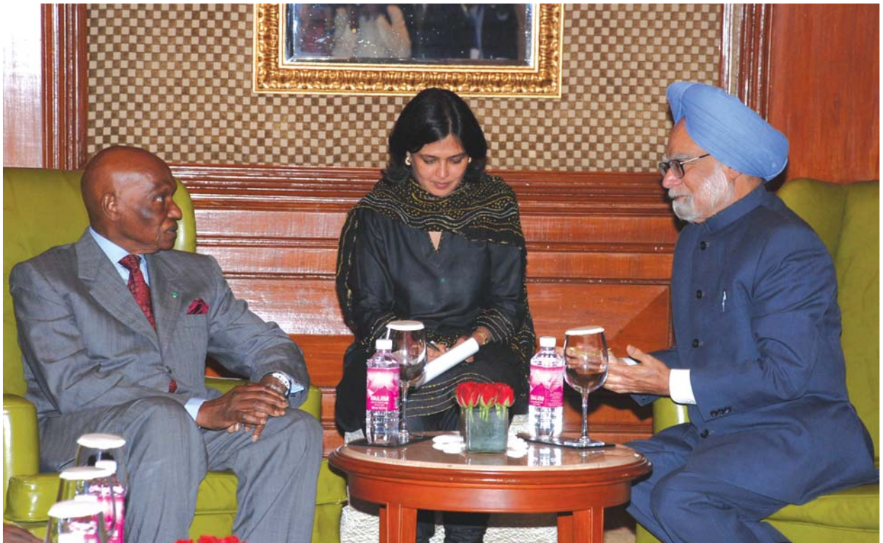
Prime Minister, Dr. Manmohan Singh meeting with the President of Senegal, Abdoulaye Wade, in New Delhi on 8 April, 2008.