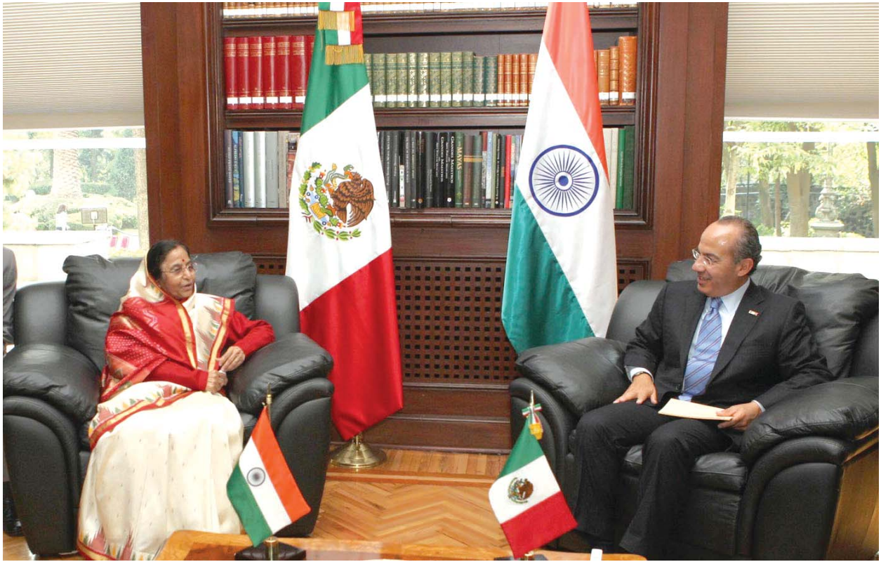
President Pratibha Devisingh Patil meeting the President of Mexico, Felipe Calderon Hinojosa, at the Los Pinos in Mexico on 17 April, 2008.