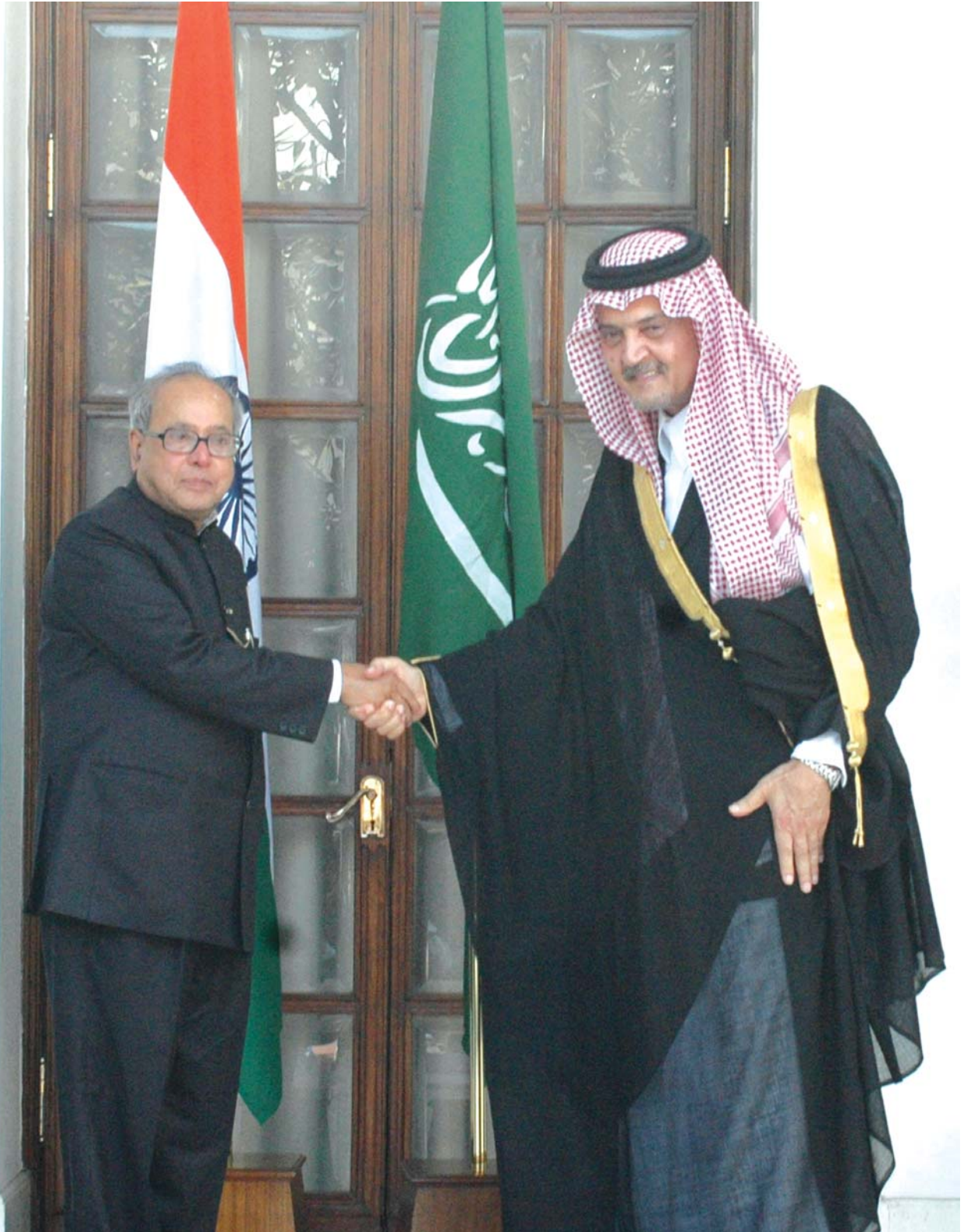
Foreign Minister of the Kingdom of Saudi Arabia, Prince Saud Al-Faisal meeting with the Union Minister of External Affairs, Pranab Mukherjee, in New Delhi on 28 February, 2008.