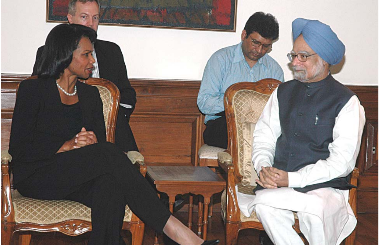
Secretary of State of the United States of America, Dr. Condoleezza Rice meeting the Prime Minister, Dr. Manmohan Singh, in New Delhi on 4 October, 2008.