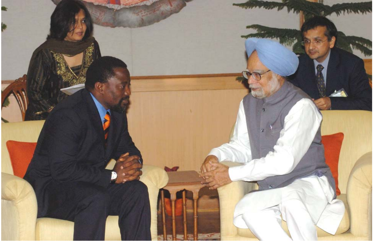
Prime Minister, Dr. Manmohan Singh meeting with the President, Democratic Republic of Congo, Joseph Kabila Kabange, in New Delhi on 9 April, 2008.