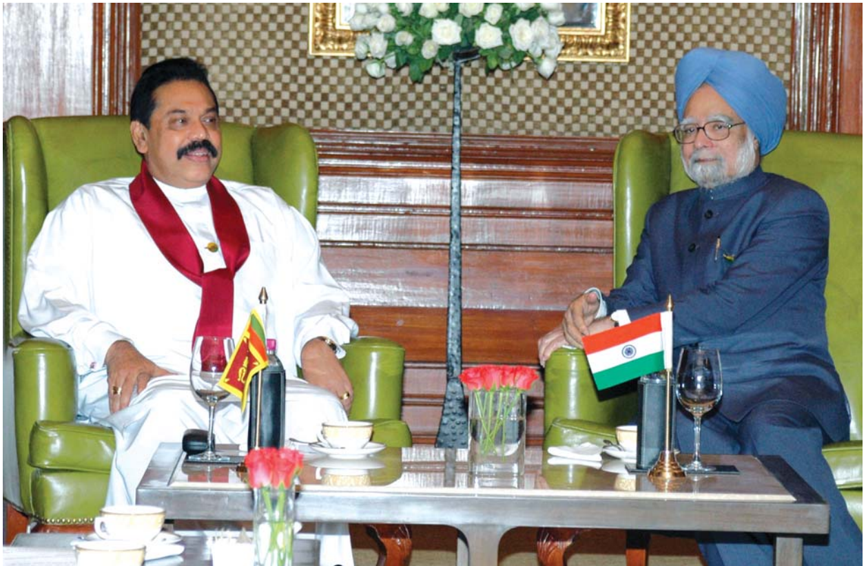
President of Sri Lanka, Mahinda Rajapaksa meeting the Prime Minister, Dr. Manmohan Singh, in New Delhi on 13 November, 2008.