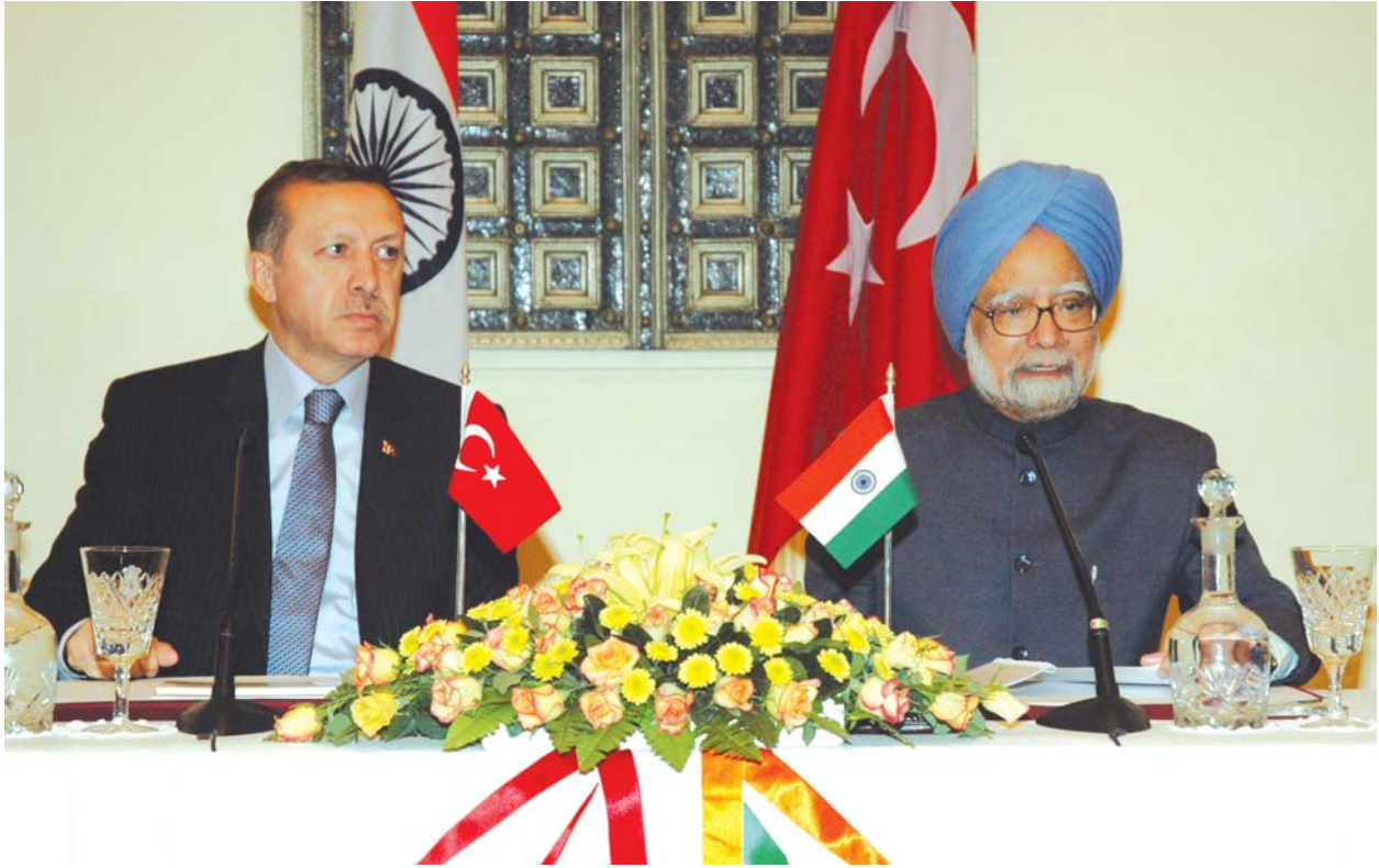
Prime Minister Dr. Manmohan Singh and the Prime Minister of the Republic of Turkey, Recep Tayyip Erdogan, at the joint press conference, in New Delhi on 21 November, 2008.