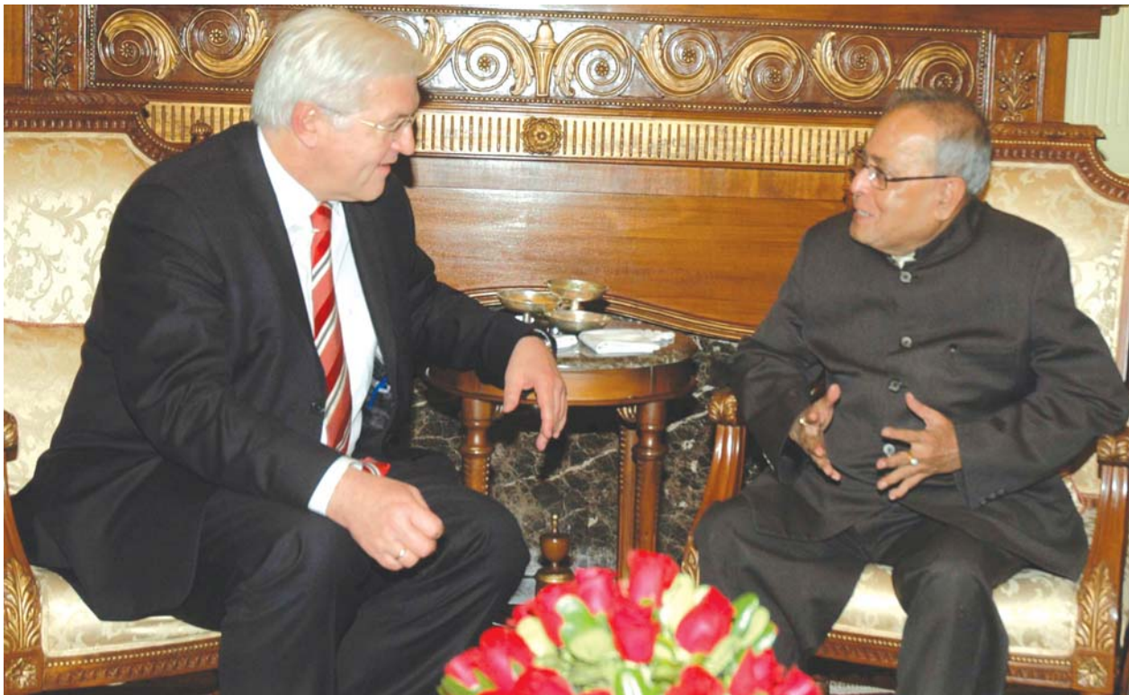
Minister for Foreign Affairs and Vice-chancellor of the Federal Republic of Germany, Dr. Frank Walter Steinmeier meeting the Union Minister of External Affairs, Pranab Mukherjee, in New Delhi on 20 November, 2008.