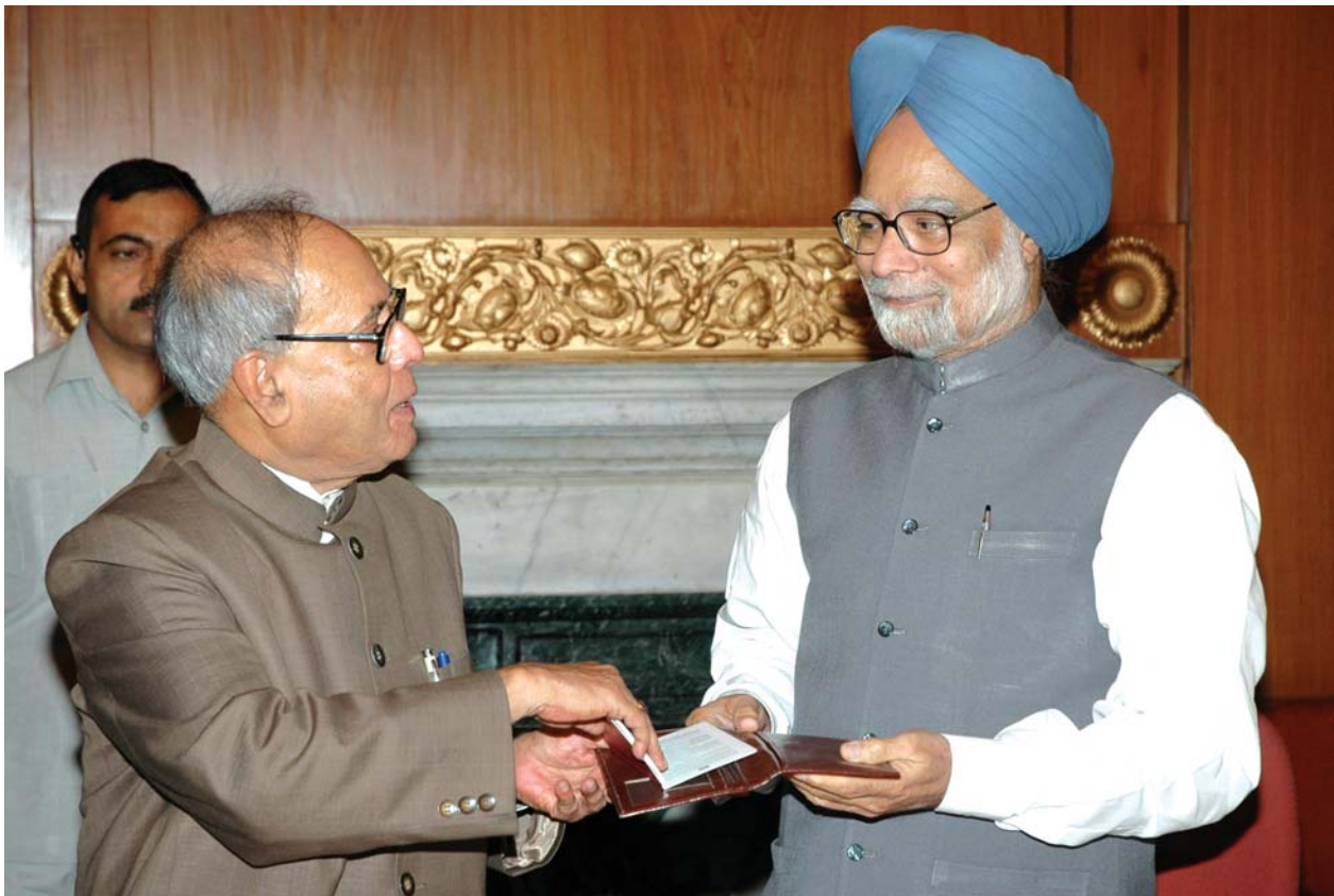
Union Minister of External Affairs, Pranab Mukherjee presenting an E-Passport to the Prime Minister, Dr. Manmohan Singh, in New Delhi on 25 June, 2008.