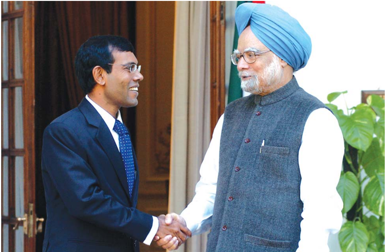
President of Maldives, Mohamed Nasheed meeting the Prime Minister, Dr. Manmohan Singh , in New Delhi on 24 December, 2008.