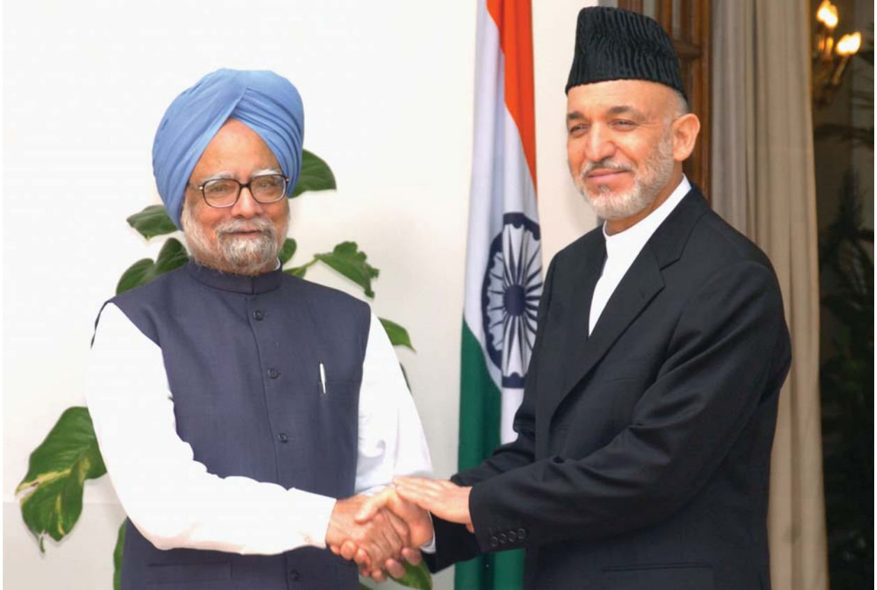
President of Afghanistan, Hamid Karzai meeting with the Prime Minister, Dr. Manmohan Singh, in New Delhi on 4 August, 2008.