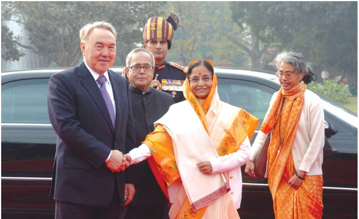
President Pratibha Devisingh Patil, Union Minister of External Affairs, Shri Pranab Mukherjee at the ceremonial reception of President of the Republic of Kazakhstan, Nursultan Nazarbayev, at Rashtrapati Bhavan, in New Delhi on 24 January, 2009.