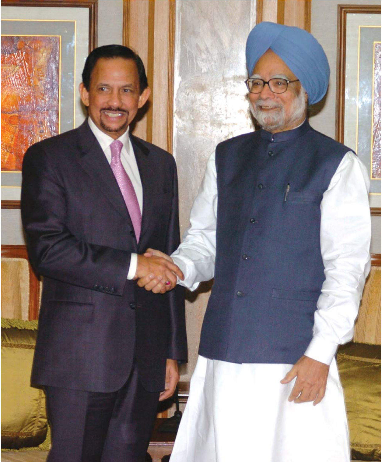
Prime Minister, Dr. Manmohan Singh with Sultan Haji Hassanal Bolkiah Mu'izzaddin Waddaulah, of Brunei, in New Delhi on 21 May, 2008.