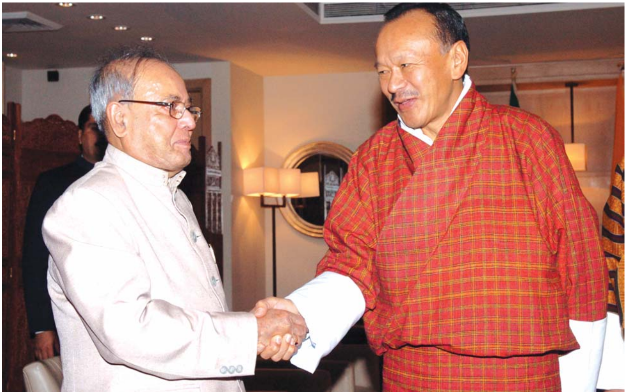
Prime Minister of Bhutan, Lyonchen Jigmi Y. Thinley meeting with the Union Minister of External Affairs, Shri Pranab Mukherjee, in New Delhi on 16 July, 2008.