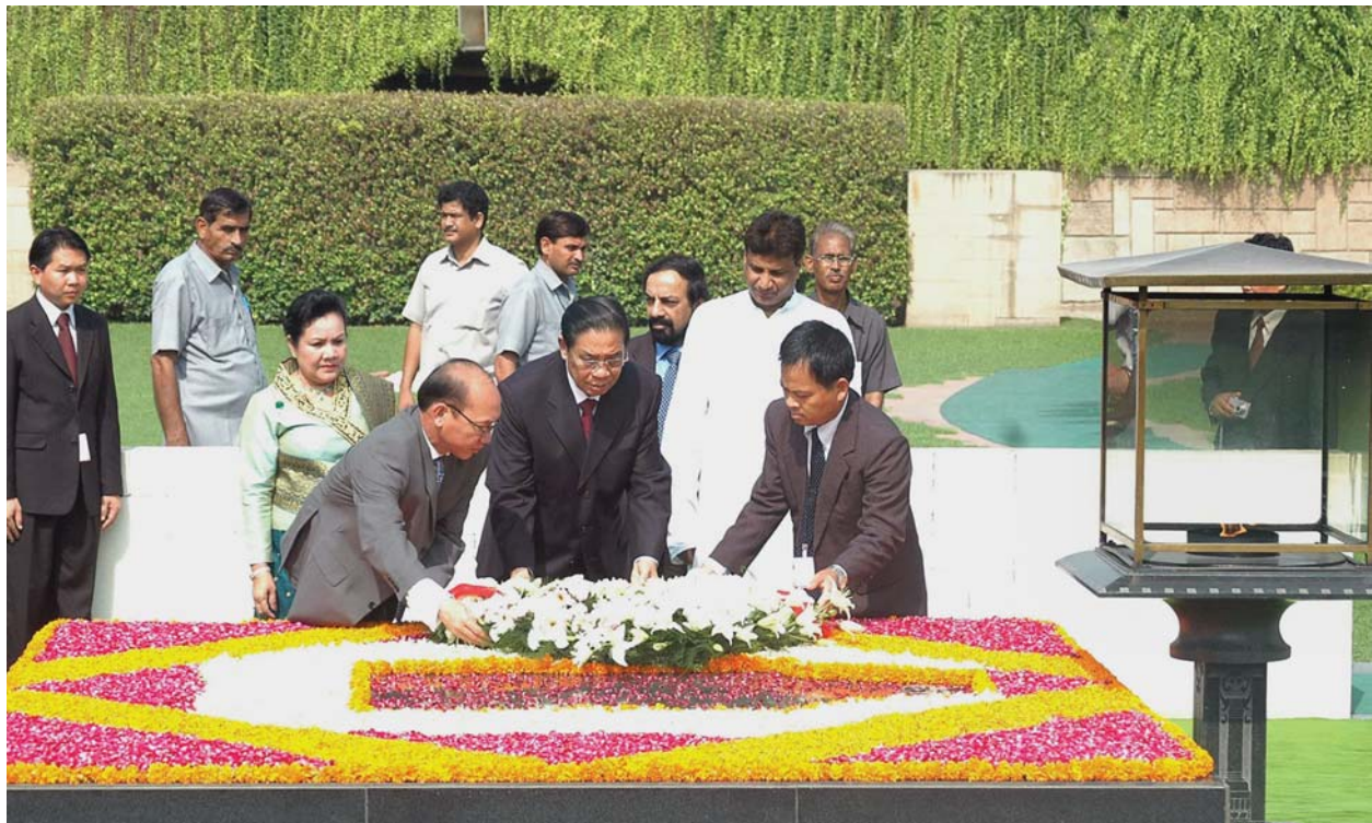
President of Lao PDR, Choummaly Sayasone laying wreath at the Samadhi of Mahatma Gandhi at Rajghat, in Delhi on 27 August, 2008.