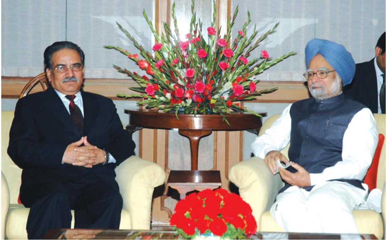
Prime Minister of Nepal, Pushpa Kamal Dahal 'Prachanda' calling on the Prime Minister, Dr. Manmohan Singh, in New Delhi on 12 November, 2008.