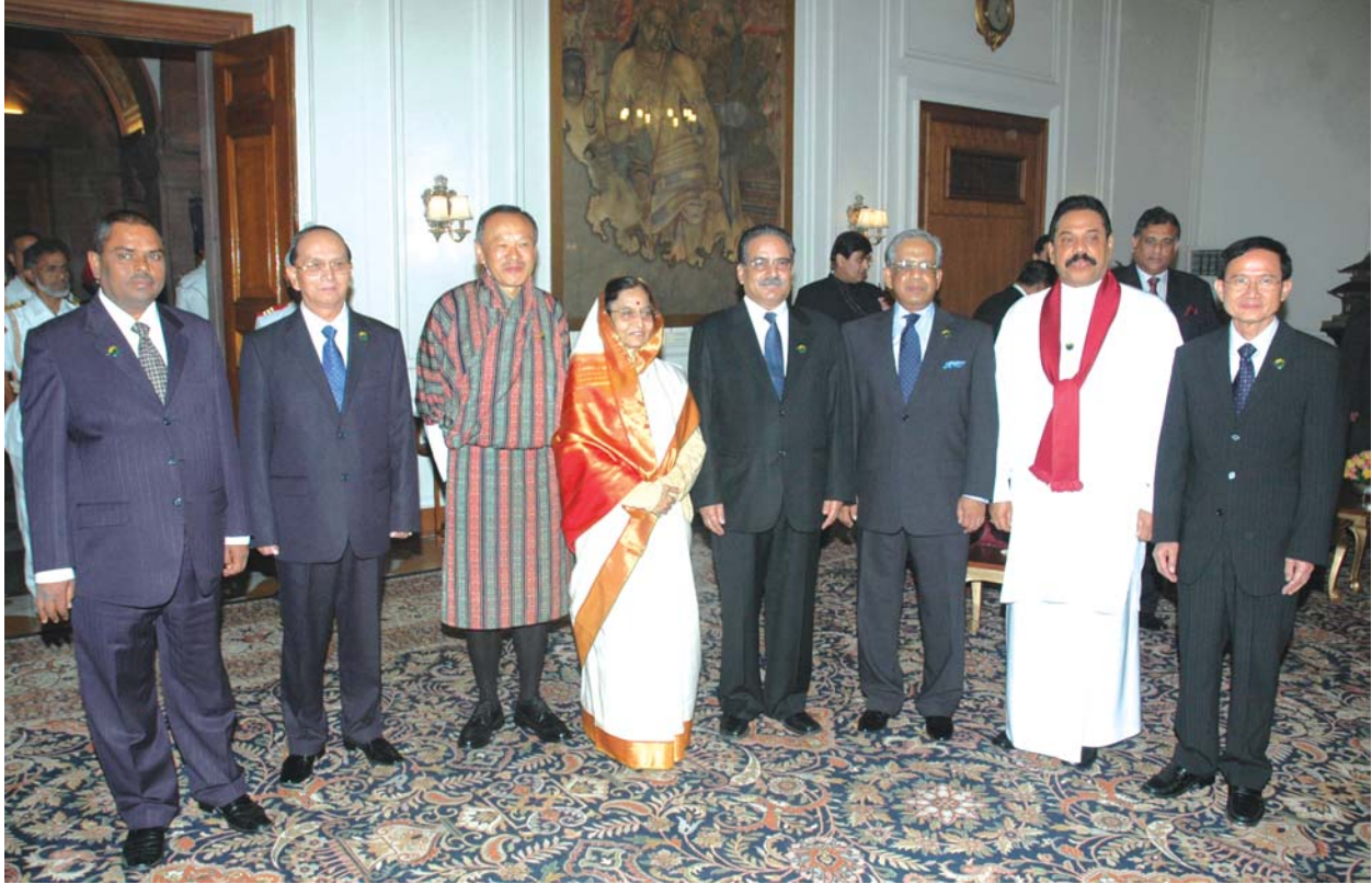
President, Pratibha Devisingh Patil with the Heads of State of BIMSTEC Summit, in New Delhi on 13 November, 2008.