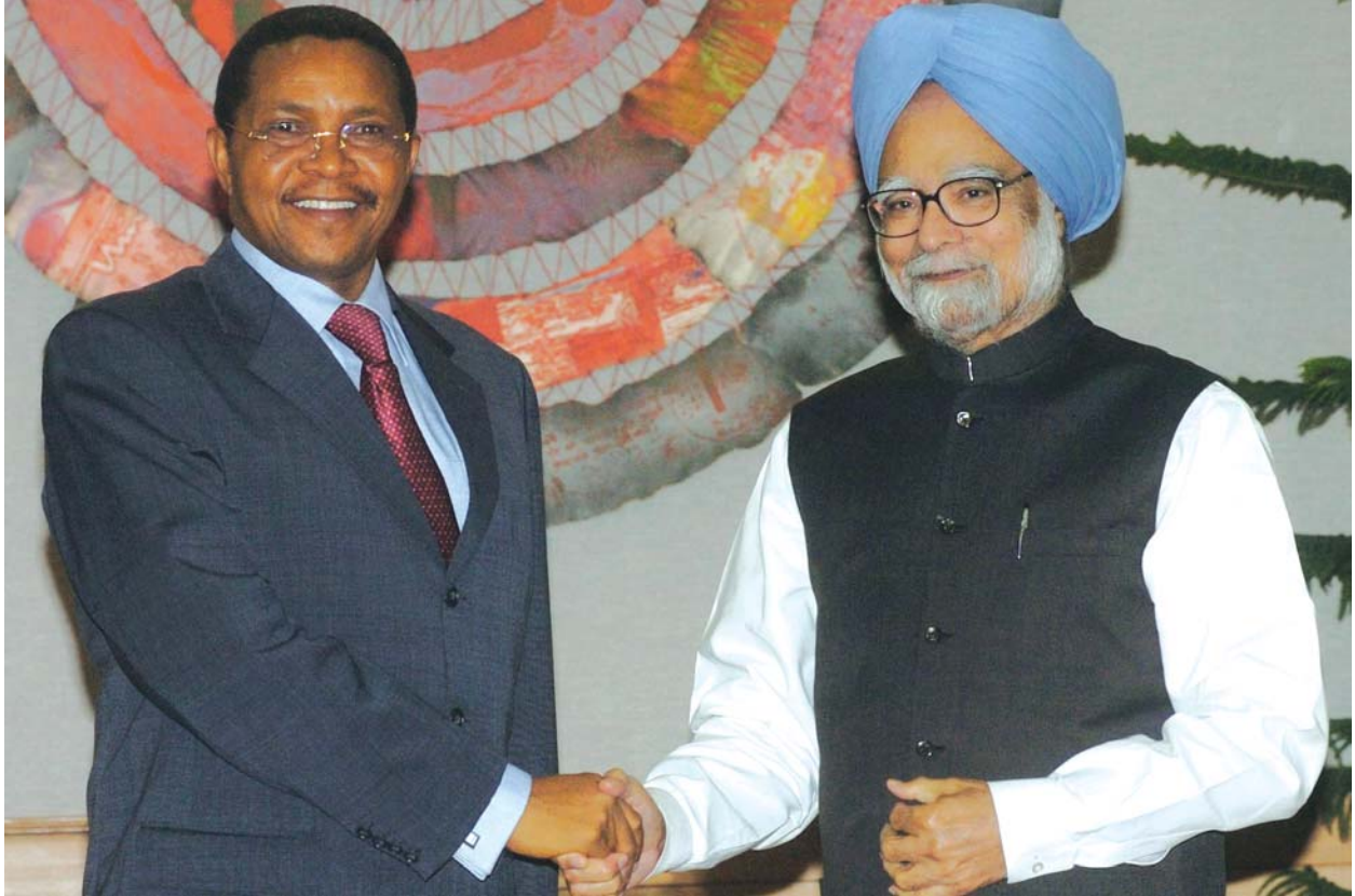
Prime Minister, Dr Manmohan Singh meeting with the President of Tanzania, Jakaya Kikwete, in New Delhi on 7 April, 2008.