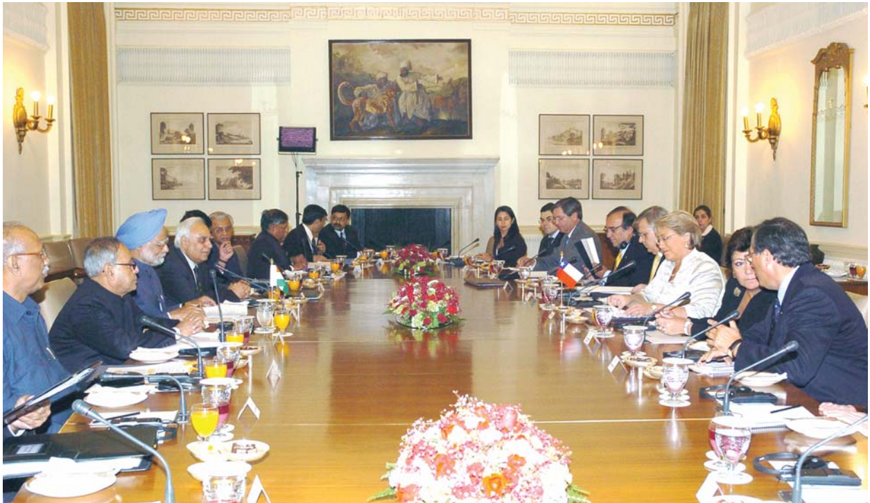
Prime Minister, Dr. Manmohan Singh with the President of the Republic of Chile, Dr. Michelle Bachelet at the delegation level talks, in New Delhi on March 17, 2009.