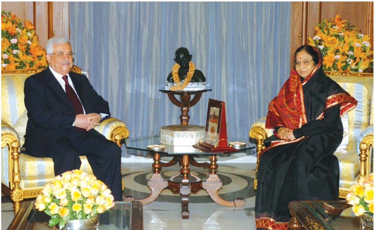
President of Palestine, Mahmoud Abbas meeting the President, Pratibha Devisingh Patil, in New Delhi on 7 October, 2008.