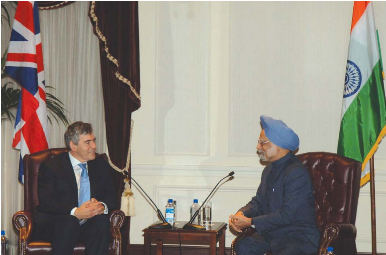
Prime Minister Dr. Manmohan Singh with the Prime Minister of United Kingdom, Gordon Brown, during his visit to the United States, in New York on 26 September, 2008.