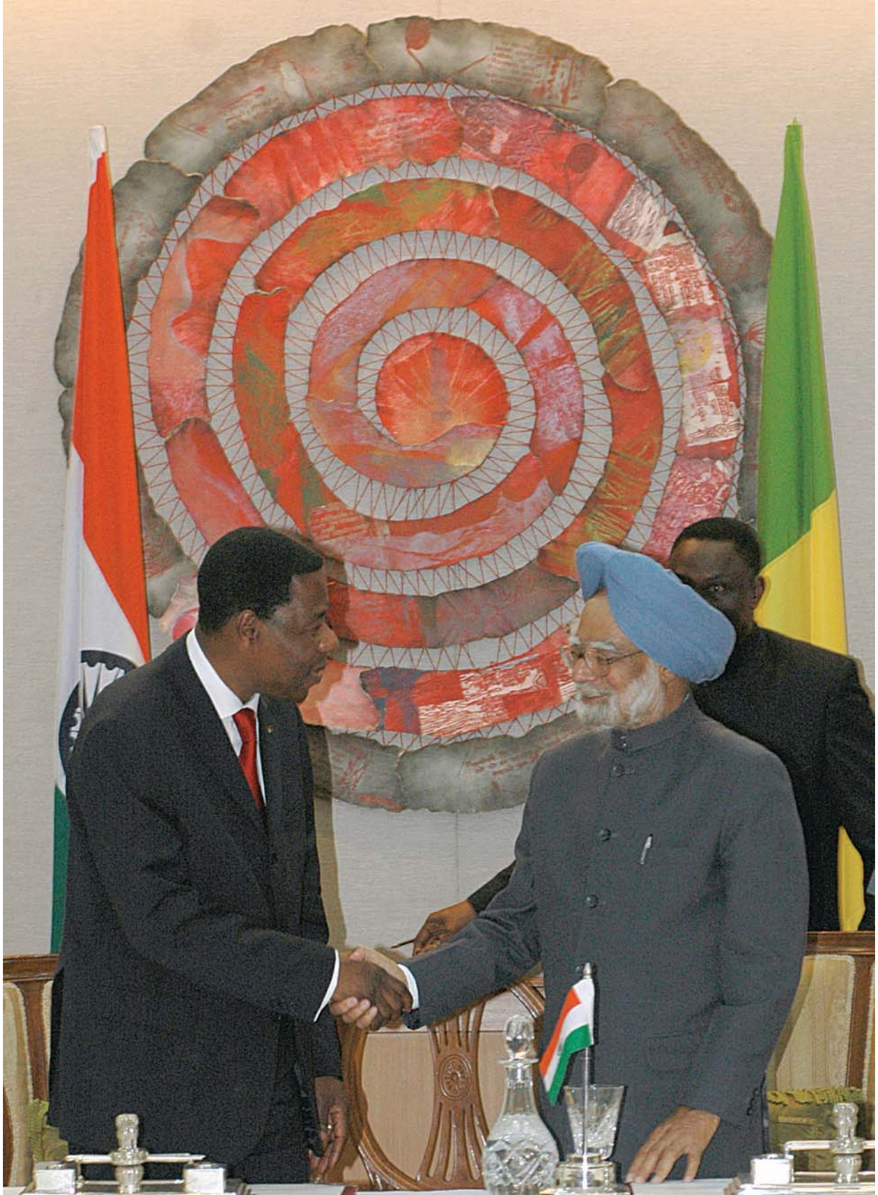
Prime Minister, Dr. Manmohan Singh with the President of Republic of Benin, Dr. Boni Yayi at the signing ceremony, in New Delhi on 4 March, 2009.