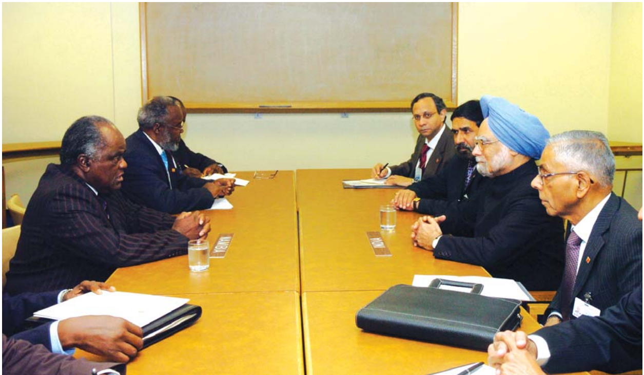
Prime Minister, Dr. Manmohan Singh meeting with the President of Namibia, Hifikepunye Pohamba on the sidelines of the 63rd Session of the UN General Assembly in New York, USA on 26 September, 2008.