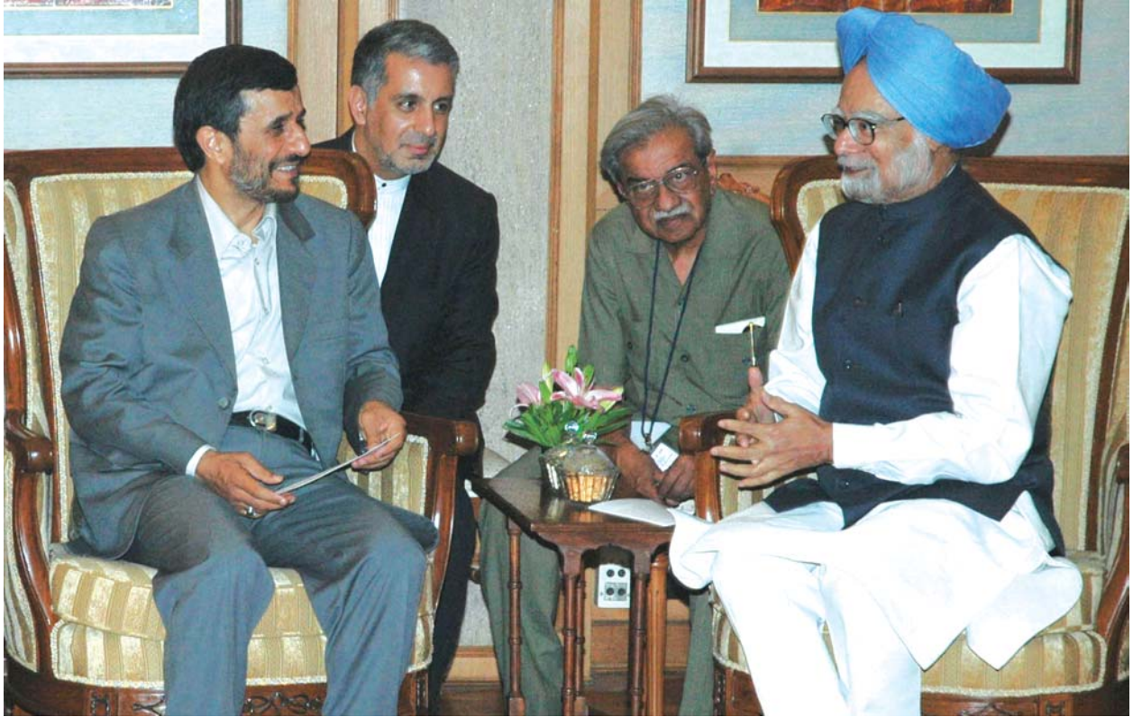
Prime Minister, Dr. Manmohan Singh with the President of the Islamic Republic of Iran, Dr. Mahmoud Ahmadinejad, in New Delhi on 29 April, 2008.