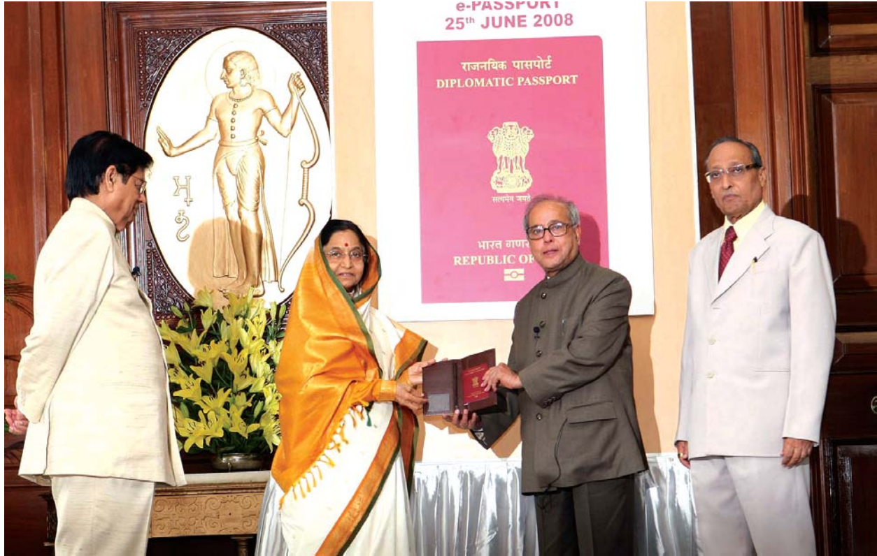
President, Pratibha Devisingh Patil receiving her "E-Passport" from the Union Minister of External Affairs, Pranab Mukherjee at Rashtrapati Bhavan in New Delhi on 25 June, 2008.