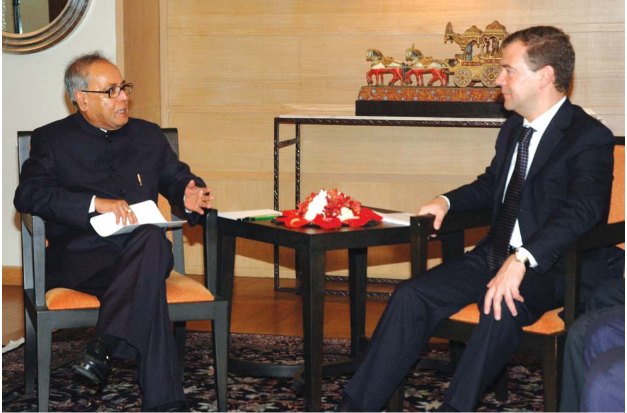
Union Minister of External Affairs, Pranab Mukherjee meeting with the President of Russia, Dmitry A. Medvedev in New Delhi on 5 December, 2008.