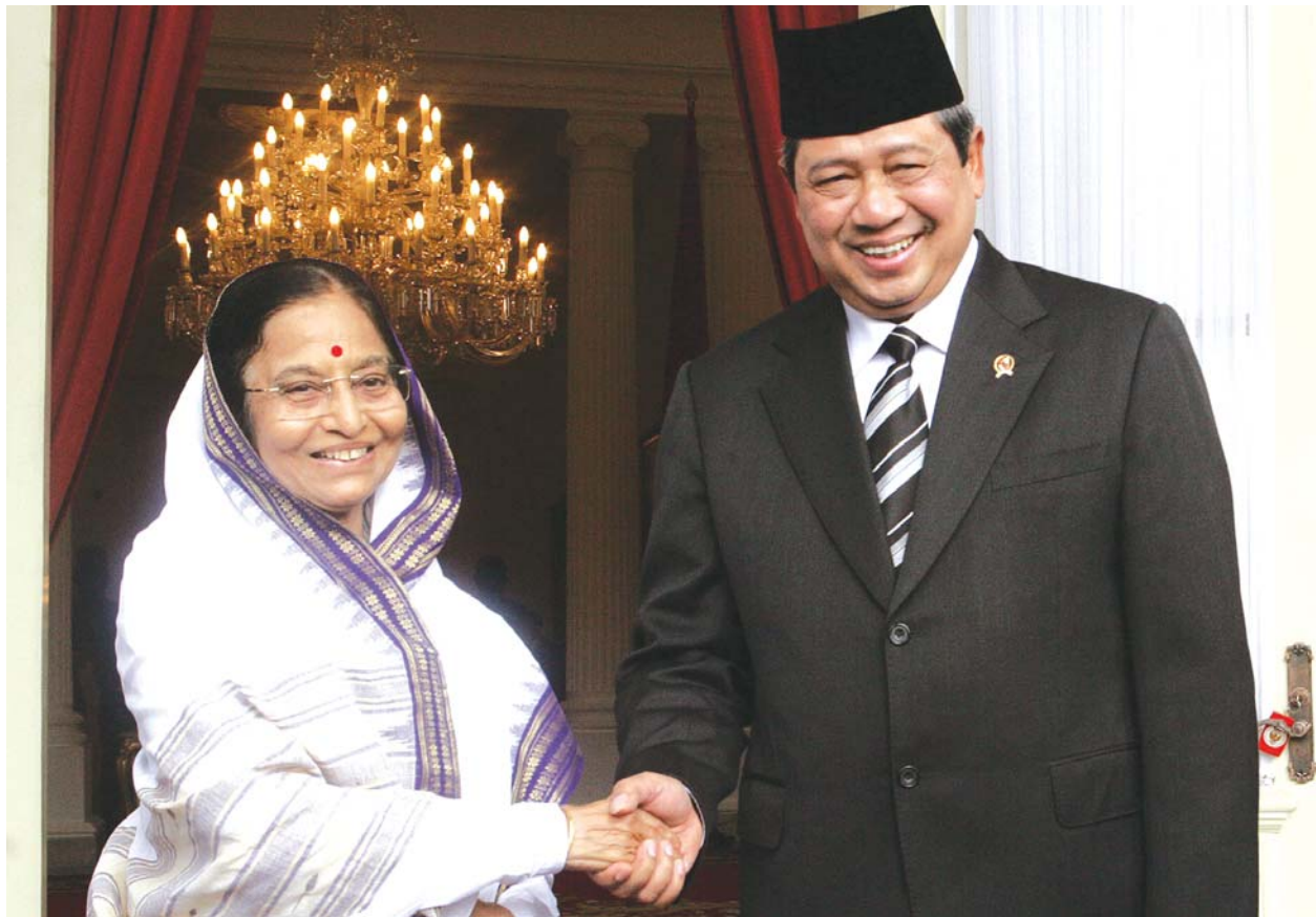
President, Pratibha Devisingh Patil meeting the President of Republic of Indonesia, Susilo Bambang Yudhoyono, at Jakarta, Indonesia on 1 December, 2008.