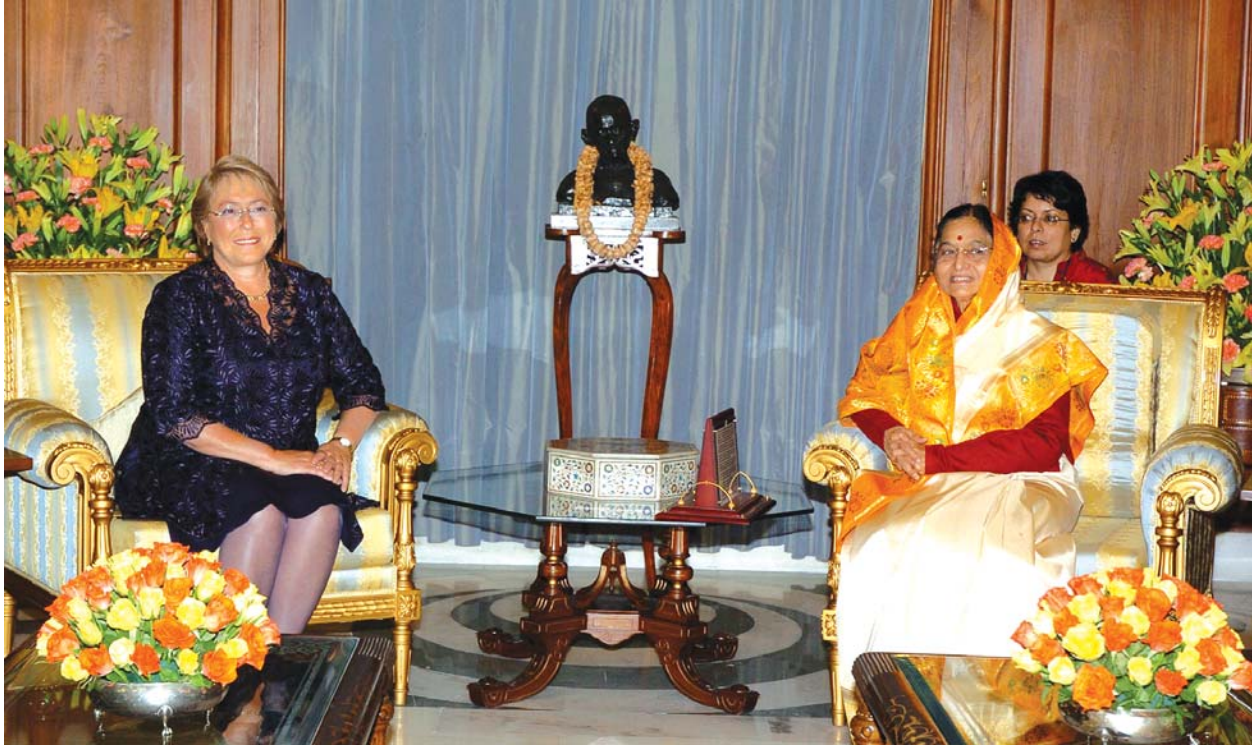
President of the Republic of Chile, Dr. Michelle Bachelet meeting the President, Pratibha Devisingh Patil, in New Delhi on 17 March, 2009.