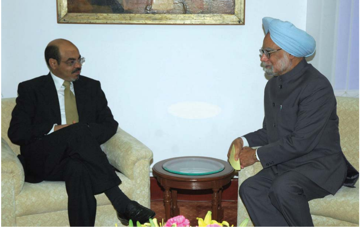
Prime Minister, Dr. Manmohan Singh with the Prime Minister of Ethiopia, Meles Zenawi, in New Delhi on 9 April, 2008.