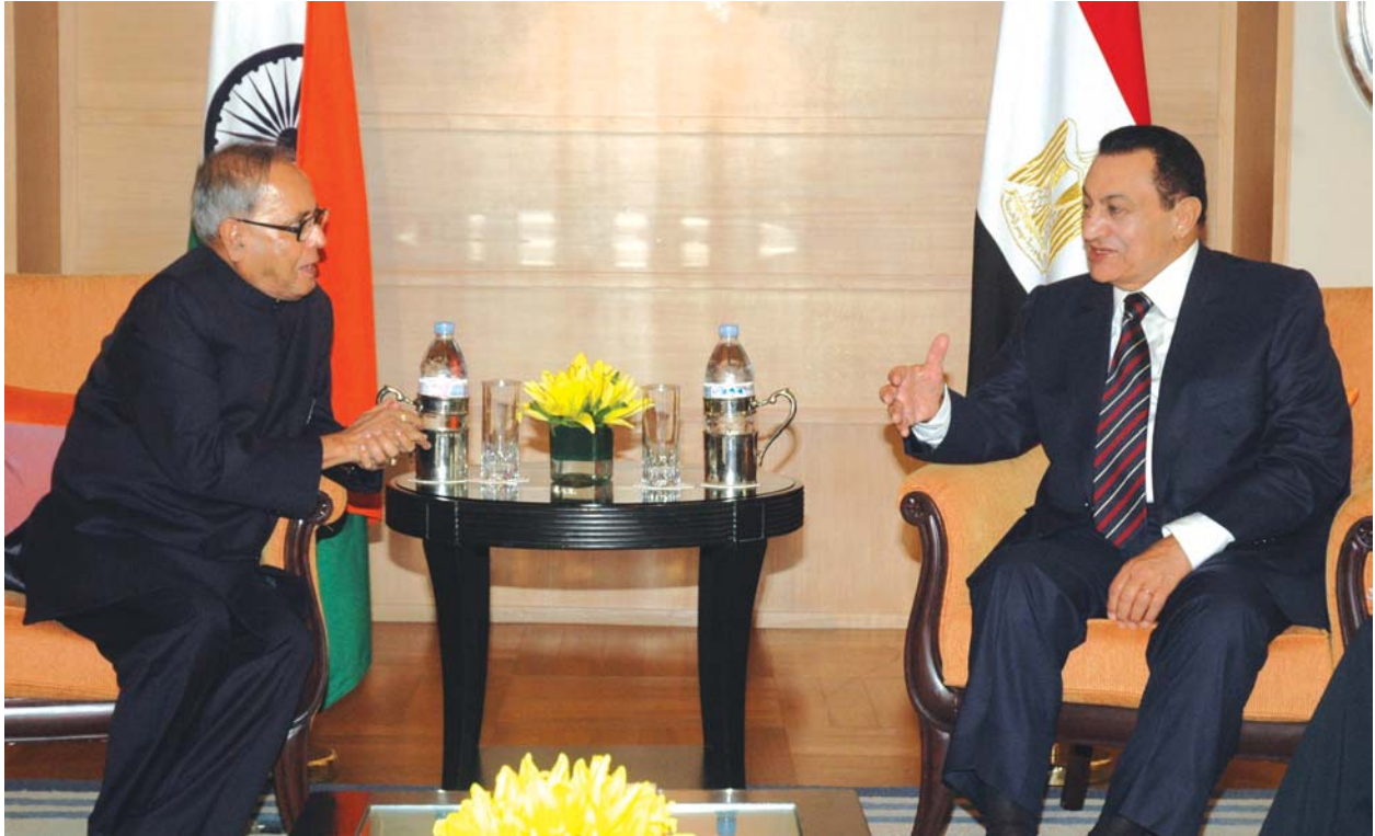
President of the Arab Republic of Egypt, Mohamed Hosny Mubarak meeting the Union Minister of External Affairs, Pranab Mukherjee in New Delhi on 18 November, 2008.