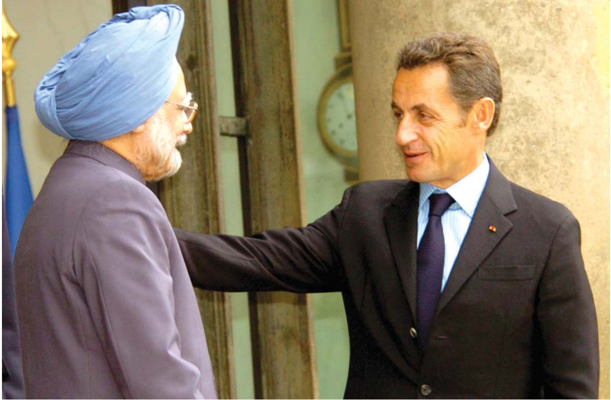
Prime Minister, Dr. Manmohan Singh with the President of France, Nicolas Sarkozy, at Elysee Palace, in Paris on 30 September, 2008.