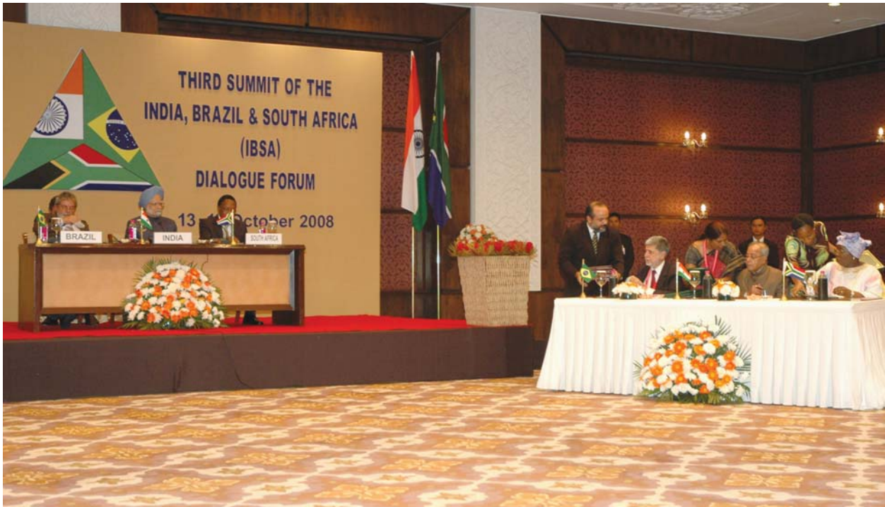
Prime Minister, Dr. Manmohan Singh, the President of Brazil, Lula da Silva and the President of South Africa, Kgalema Motlanthe witnessing the signing of the trilateral Agreements/MoUs, at the Third Summit of the India, Brazil & South Africa (IBSA) Dialogue Forum, in New Delhi on 15 October, 2008.