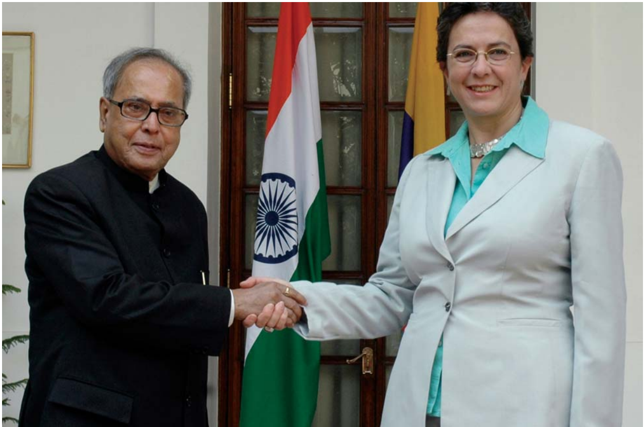
Minister of Foreign Affairs of Ecuador, Maria Isabel Salvador, meeting the Union Minister of External Affairs, Shri Pranab Mukherjee, in New Delhi on 17 November, 2008