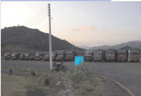
Indian Trucks Waiting to Cross

The people crossing the LoC from either side are given permission on a document called Entry Permit. The travel at present is restricted to the relatives residing on both the sides of the LoC. People interested in visiting have to apply with relevant documents to their respective governments. After due verification, an Entry Permit is issued to the people to travel. The process of getting an Entry Permit issued takes approximately 6 to 18 months. People are allowed to stay for 28 days and can be given