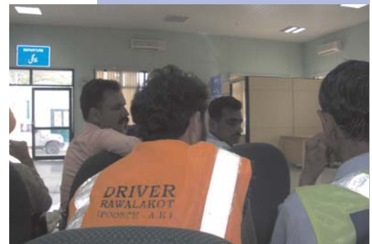
Drivers in Uniform

Trade across the LoC is restricted to 21 items. These are the products produced on both sides of the LoC. Trucks with valid papers are allowed to enter. The process is computerized and single-entry permits known as Truck Entry Permits are issued in triplicate by the respective Trade Facilitation Officers (TFOs). The drivers are given entry permission after a thorough checking of their background. The permits contain a photo ID of the driver, his name, address, license number and details of the vehicle. It also specifies that there is no contraband or dangerous material in the vehicle or in the consignment. The drivers of these trucks are made to wear bright yellow and pink jackets/vests with "Driver-Chakoti/Rawalakote" and "Driver Salamabad/Chakandabagh" respectively inscribed on the back. They are permitted till the designated points where they offload their trucks. The same drivers are not allowed frequently 6 . Once the trucks enter, they have to return the same day after offloading.