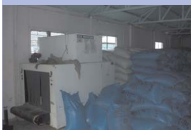
Scanning Machine for Goods

Around 170 traders have applied for permission to trade in the Poonch sector.