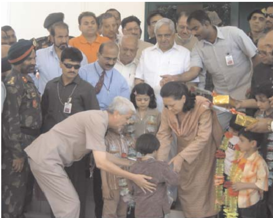
Inauguration of Poonch-Rawalakote Bus Service