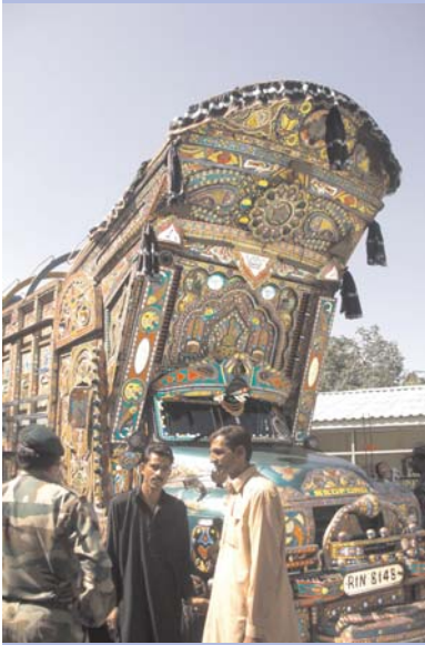
Pakistani Truck with Goods