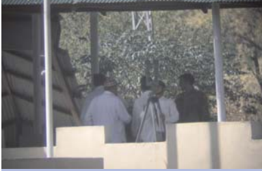
Keeping an Eye Pakistani Security Officials Chakhoti, POK

... there had been no support for separatism in Shia-dominated Kargil