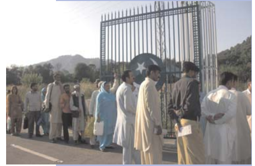
Waiting to Cross the LoC, Poonch

It is important to note that given the difficult terrain in Leh, as also in areas close to the LoC in the other two regions, i.e., the Valley and Jammu, the opening of the routes is a major infrastructural challenge. The Border Roads Organisation (BRO) must be complimented for the roads they have already laid down for connecting the three regions of the state and other ongoing projects to increase intra-state communication. However, much remains to be done. The opening of the LoC demonstrates remarkable political will on the part the leadership of the two countries and attests to their efforts in overcoming the impediments. The support of the mainstream political parties in Jammu and Kashmir as well as the separatist leaders to the process is noteworthy.