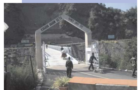
Bridge of Peace, Uri

It has generated enormous goodwill as people appreciate the mechanism that has been put in place for relatives from the two sides of the LoC to meet.