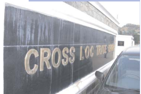
Trade Facilitation Centre, Chakan da Bagh

Most of the interviewees asked for improvement of facilities for travel.