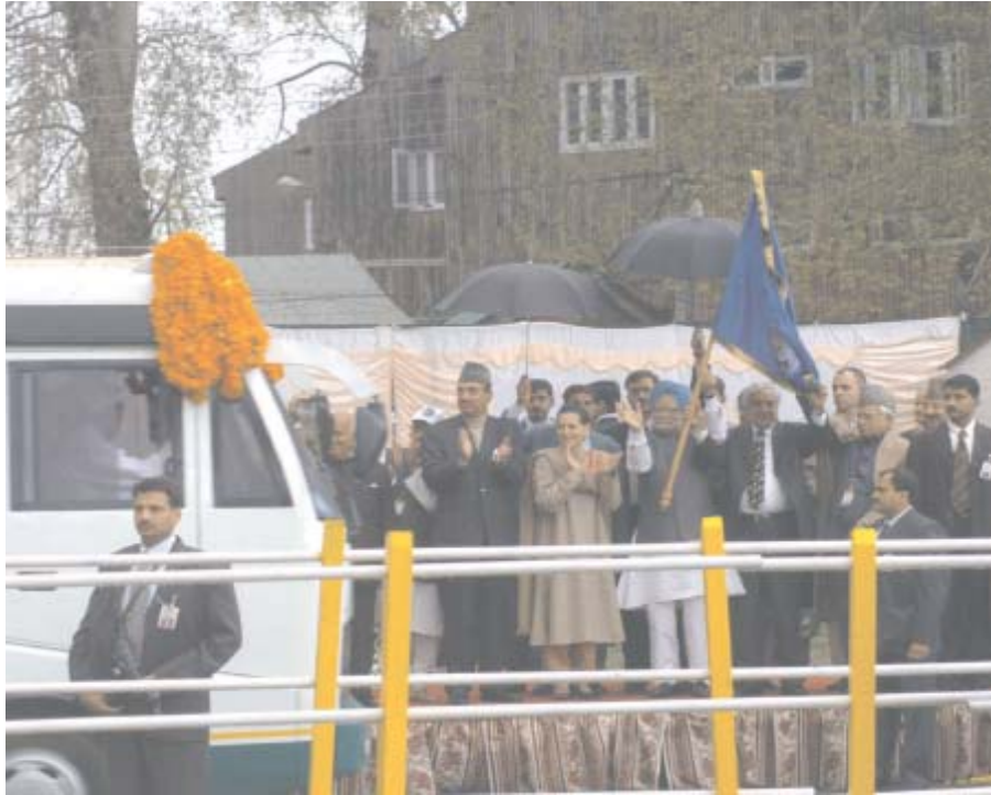
Inauguration of Srinagar-Muzaffarabad Bus Service

Manmohan Singh, Prime Minister of India, Amritsar, March 24, 2006